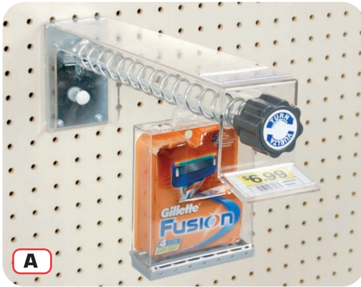
Spiral Anti-Sweep Hook shown with Fort Knox™ Safer™ Security Box

The Spiral Anti-Sweep Hook from FFR-DSI provides a secure solution for high-theft pegged merchandise, while maintaining product availability for self-service by the customer. The merchandiser is versatile and can accommodate multiple SKU's within a product category. When the knob is turned, an audible clicking sound alerts sales associates that someone is shopping the product and the product is being dispensed.